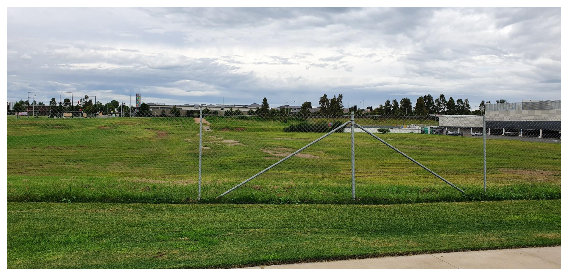
Figure 6: View from existing pedestrian pathway on the northern edge of the subject site, in the approximate location of the future pedestrian path. Facing south, the vacant portion of the site is visible with the existing Podium shopping centre on the right.