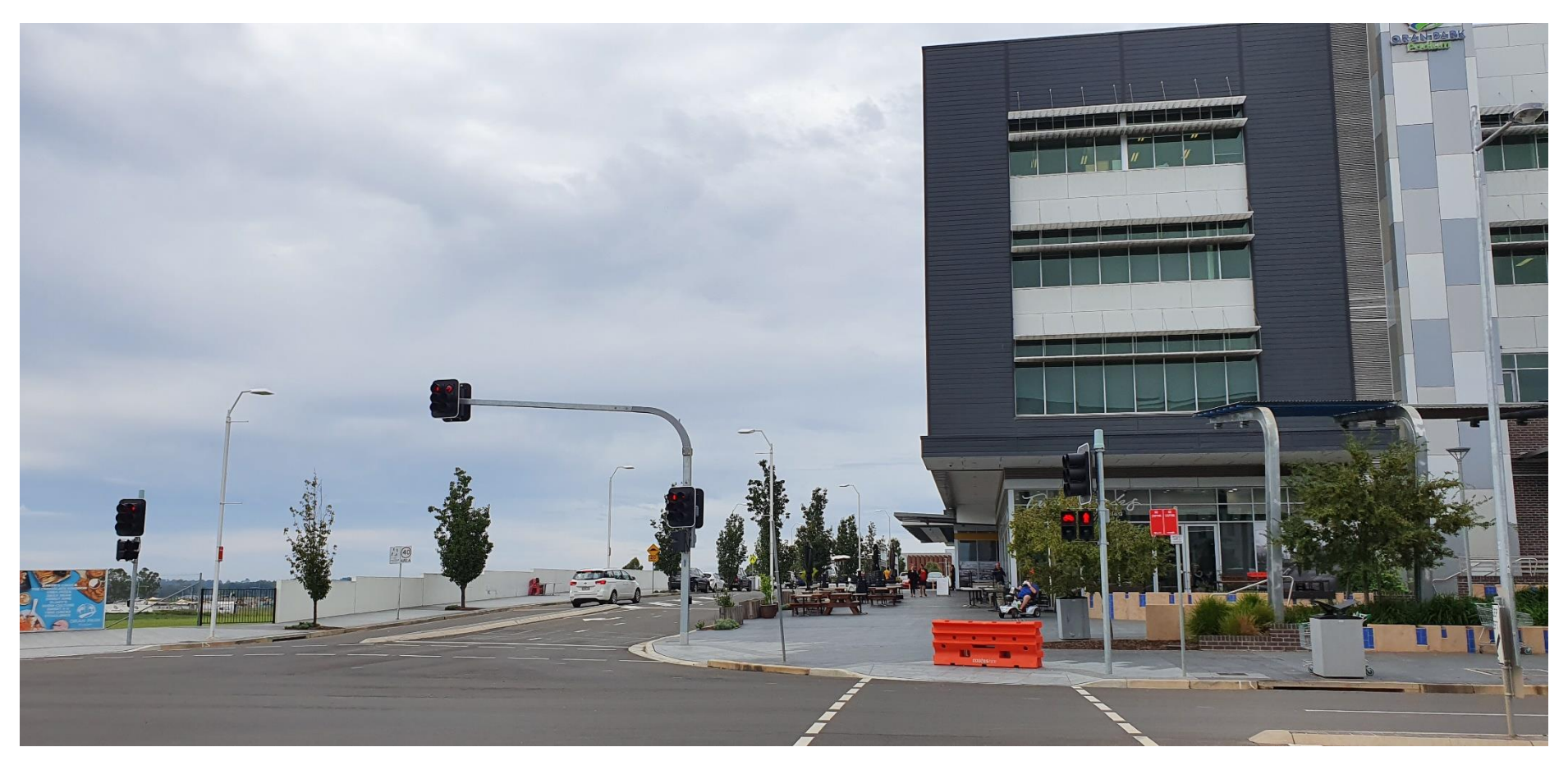
Figure 18: View from the south western corner of Oran Park Drive and Podium Way (known as Main Street in the DCP) facing the existing Podium shopping centre. Podium Way (Main Street) is partially constructed to the edge of the existing Podium shopping centre.