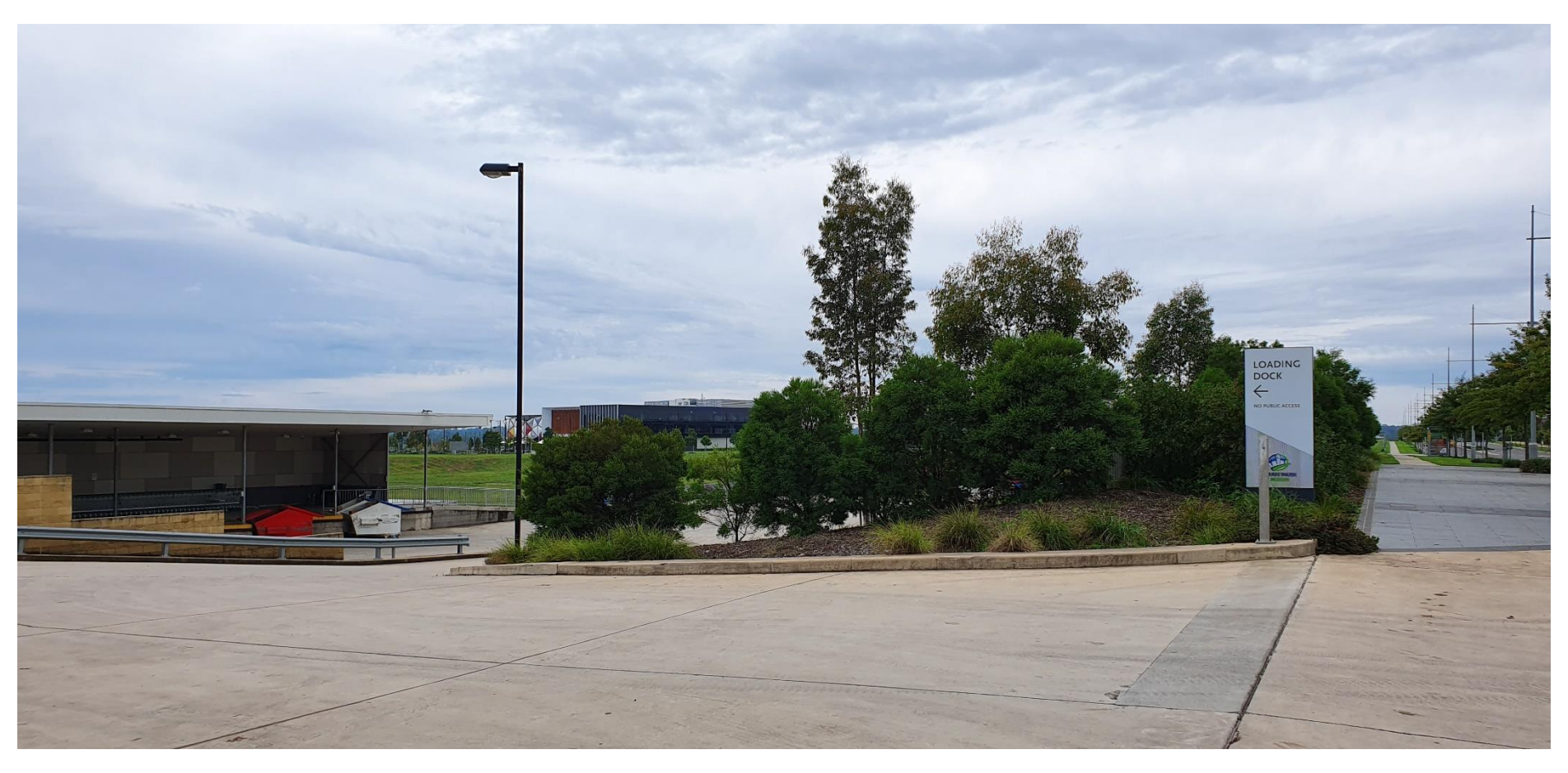
Figure 13: View of existing loading dock area. The proposed loading dock will extend from the existing one. Note the slope from the street to the building and landscaped edge.