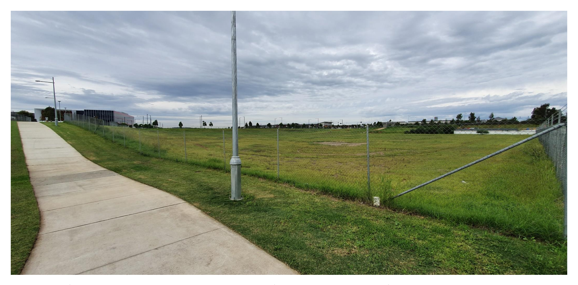
Figure 10: View from existing pedestrian pathway on the northern edge of the subject site at the corner of the existing Podium shopping centre, in the approximate location of the future pedestrian path. Facing south easterly, the vacant portion of the site is visible.