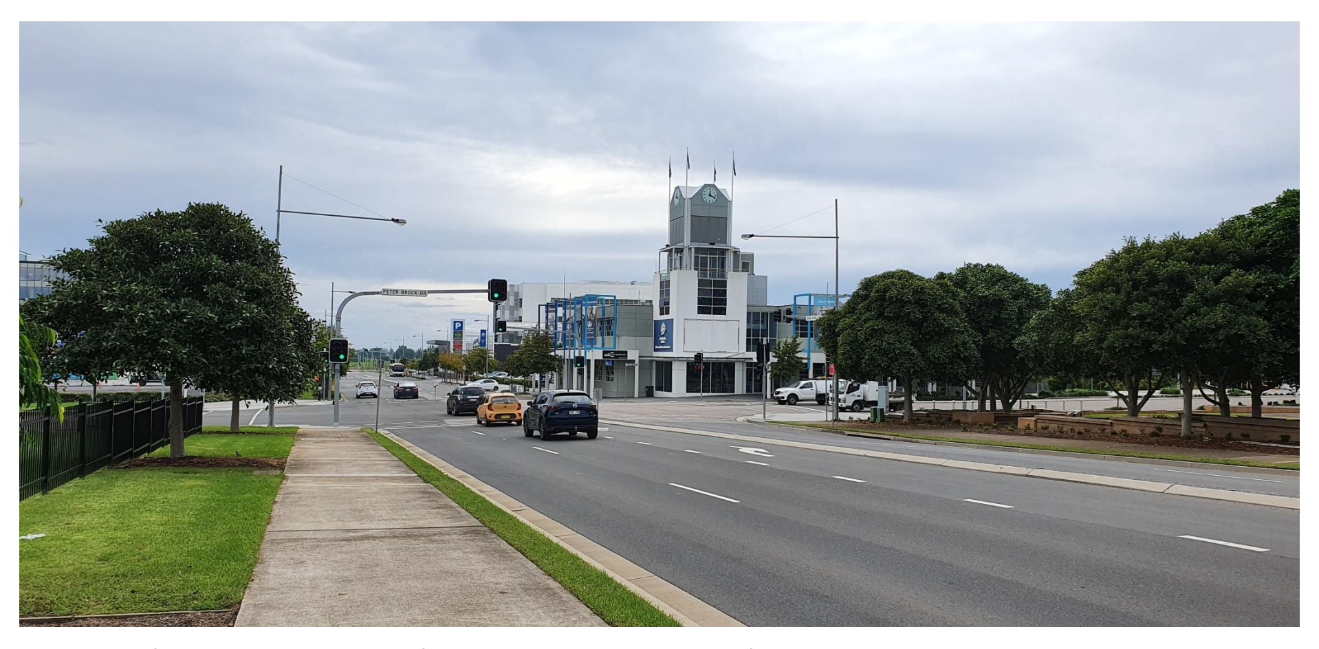
Figure 14: View from the south western corner of Peter Brock Drive and Oran Park Drive facing the existing Podium shopping centre. Note the architectural clock tower feature.