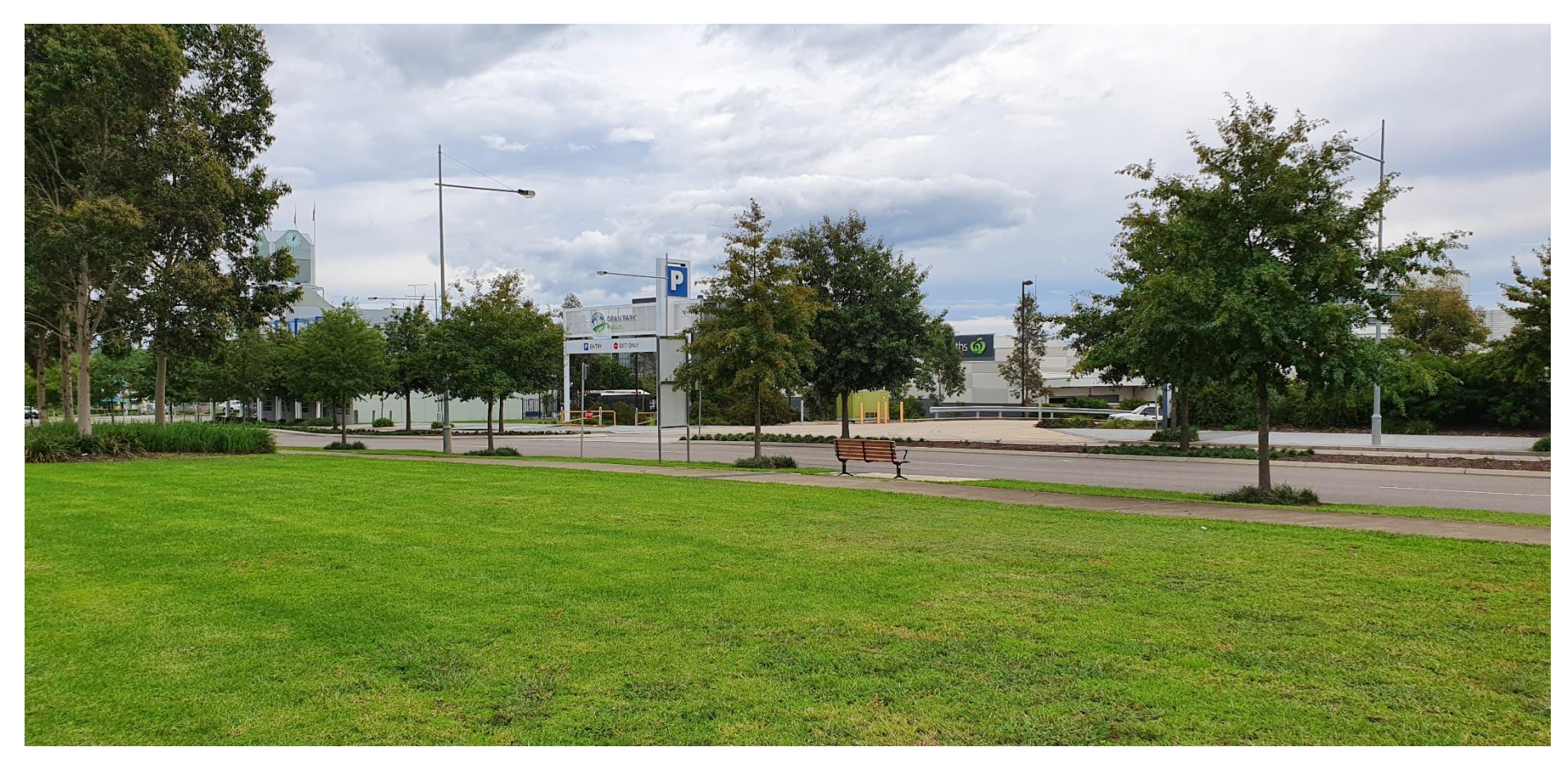
Figure 12: View from the corner of Peter Brock Drive and Seton Street. Facing north westerly, the existing car park entry/exit driveway and loading dock driveway are visible.