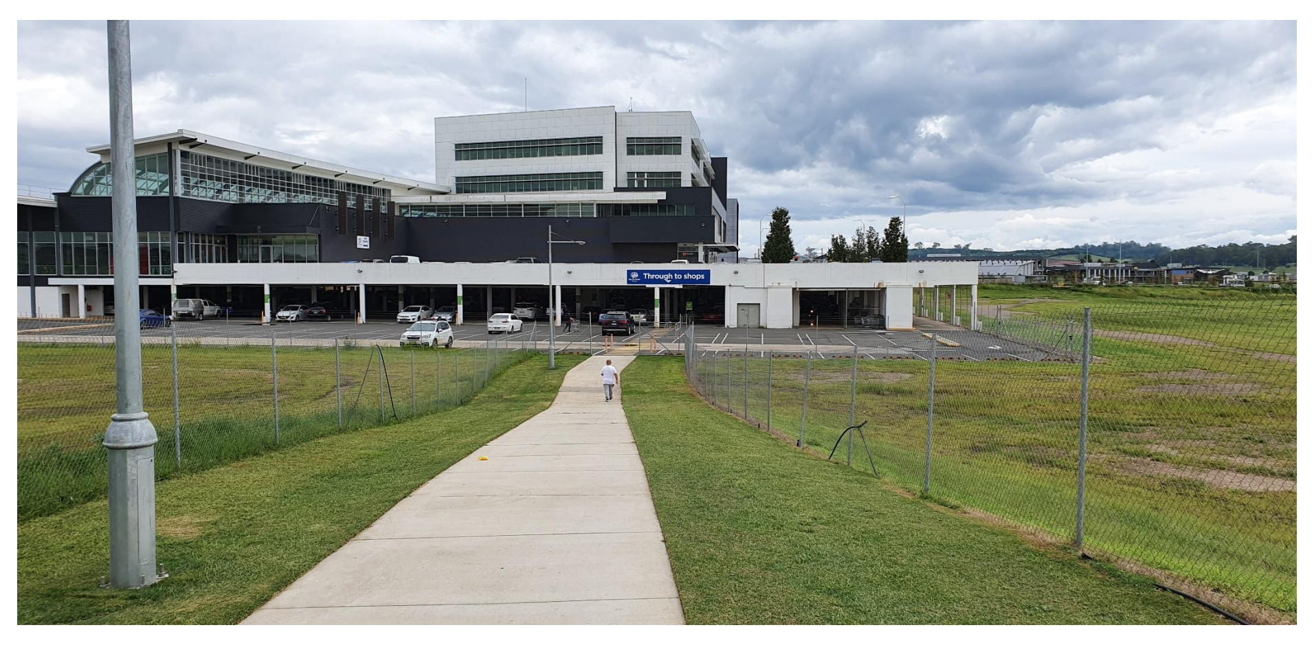
Figure 8: View from existing pedestrian pathway on the northern edge of the subject site, in the approximate location of the future pedestrian path. Facing west, the existing Podium shopping centre with commercial tower is visible.