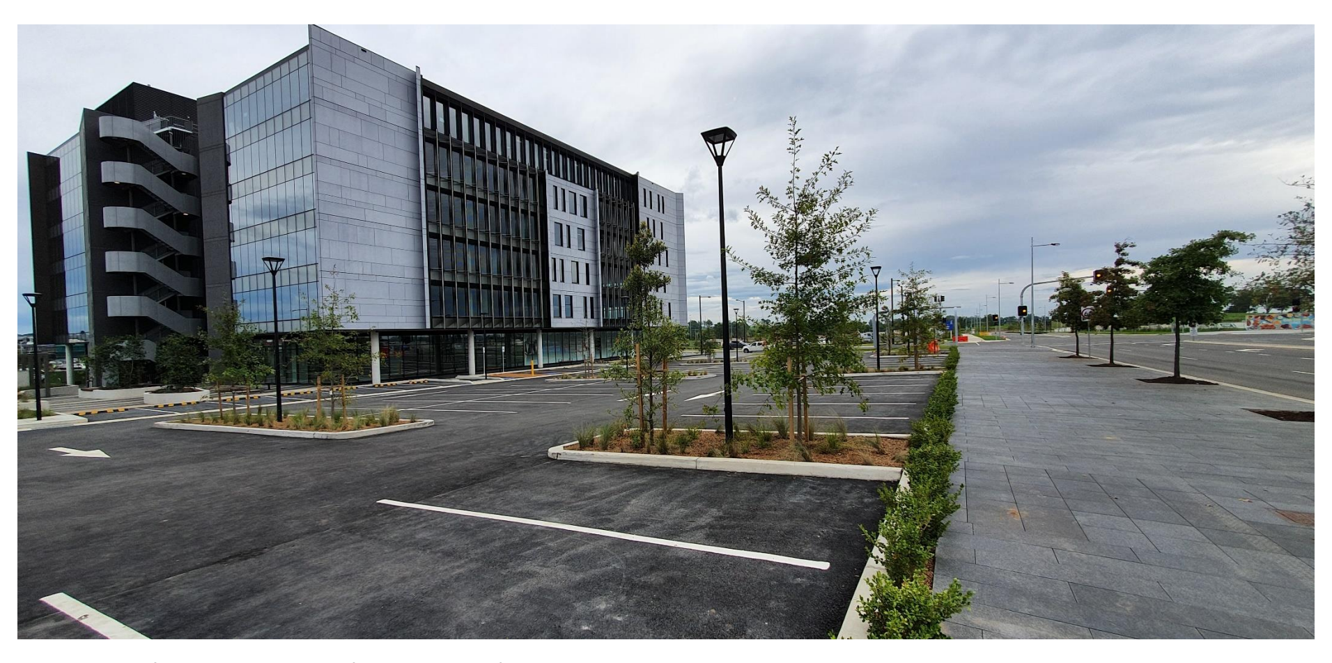
Figure 16: View from the western side of Oran Park Drive facing the recently constructed 6 storey commercial building. This building is opposite the existing portion of the Podium shopping centre.