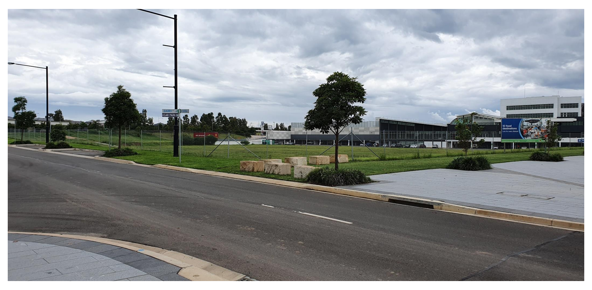
Figure 1: View from north eastern corner of Dairy Street and Central Avenue, Oran Park. Facing south west, the site is visible in its entirety with the existing Podium Stage 1 building on the right of the photograph and loading area toward the centre.