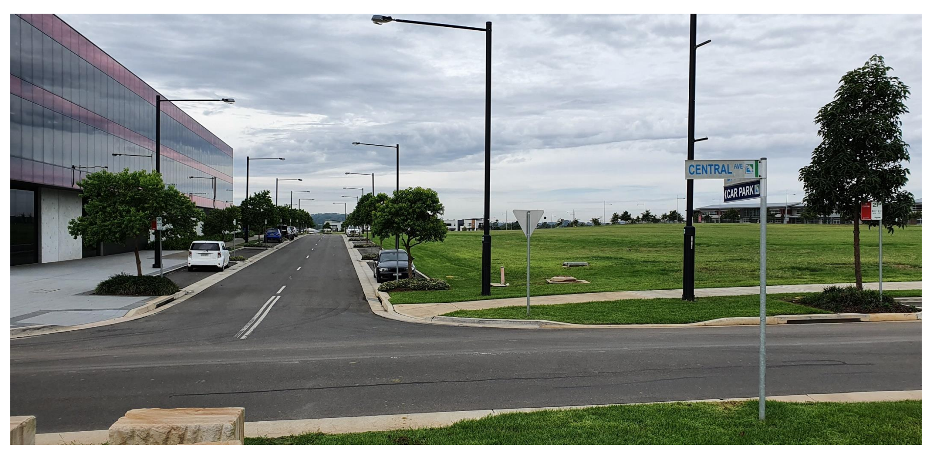
Figure 3: View from western corner of Dairy Street and Central Avenue, Oran Park. Taken from the subject site, facing directly east the Camden Council building to the left of the image with a vacant site to the right. The vacant site is envisaged to be mixed use by the Oran Park Indicative Layout Plan. The maximum height of building for the vacant site is 24m.