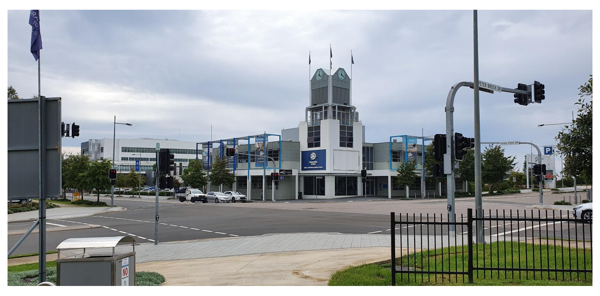
Figure 15: View from the south western corner of Peter Brock Drive and Oran Park Drive facing the existing Podium shopping centre. Note the architectural clock tower feature.