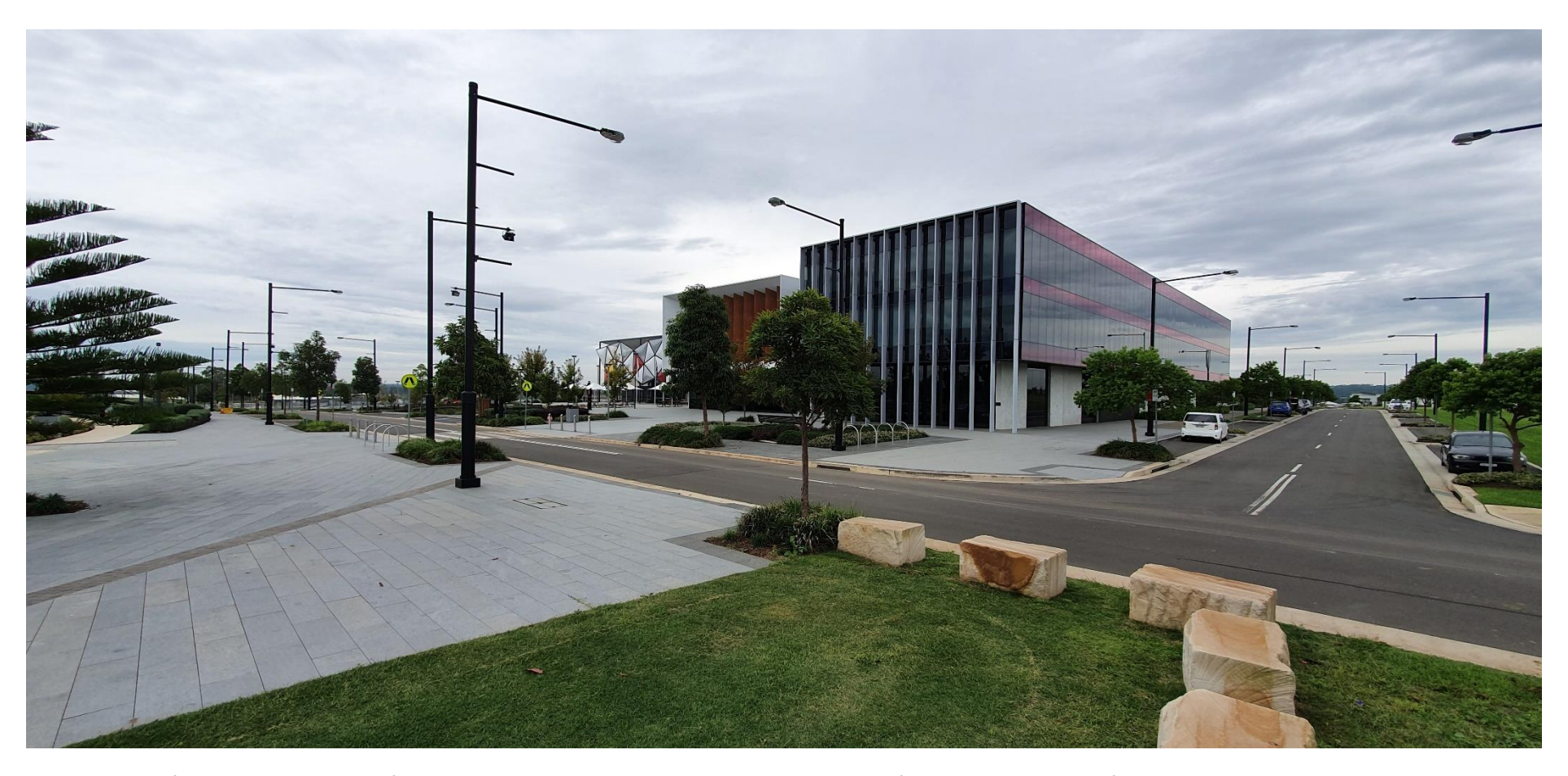
Figure 2: View from western corner of Dairy Street and Central Avenue, Oran Park. Taken from the subject site, facing north east the Camden Council building is the centre of the image with the Oran Park Library visible in the background.