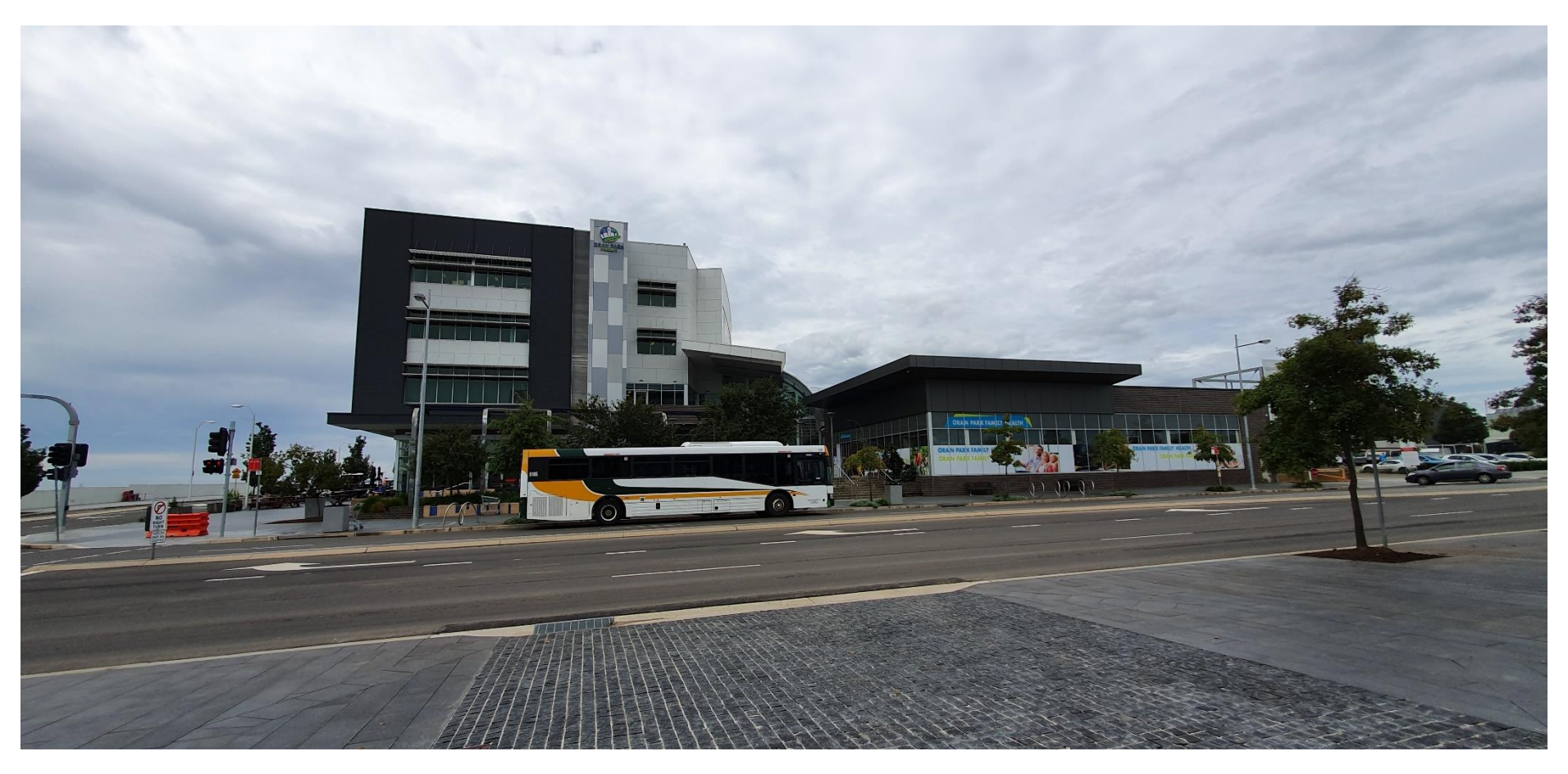
Figure 17: View from the south western corner of Oran Park Drive and Podium Way (known as Main Street in the DCP) facing the existing Podium shopping centre.