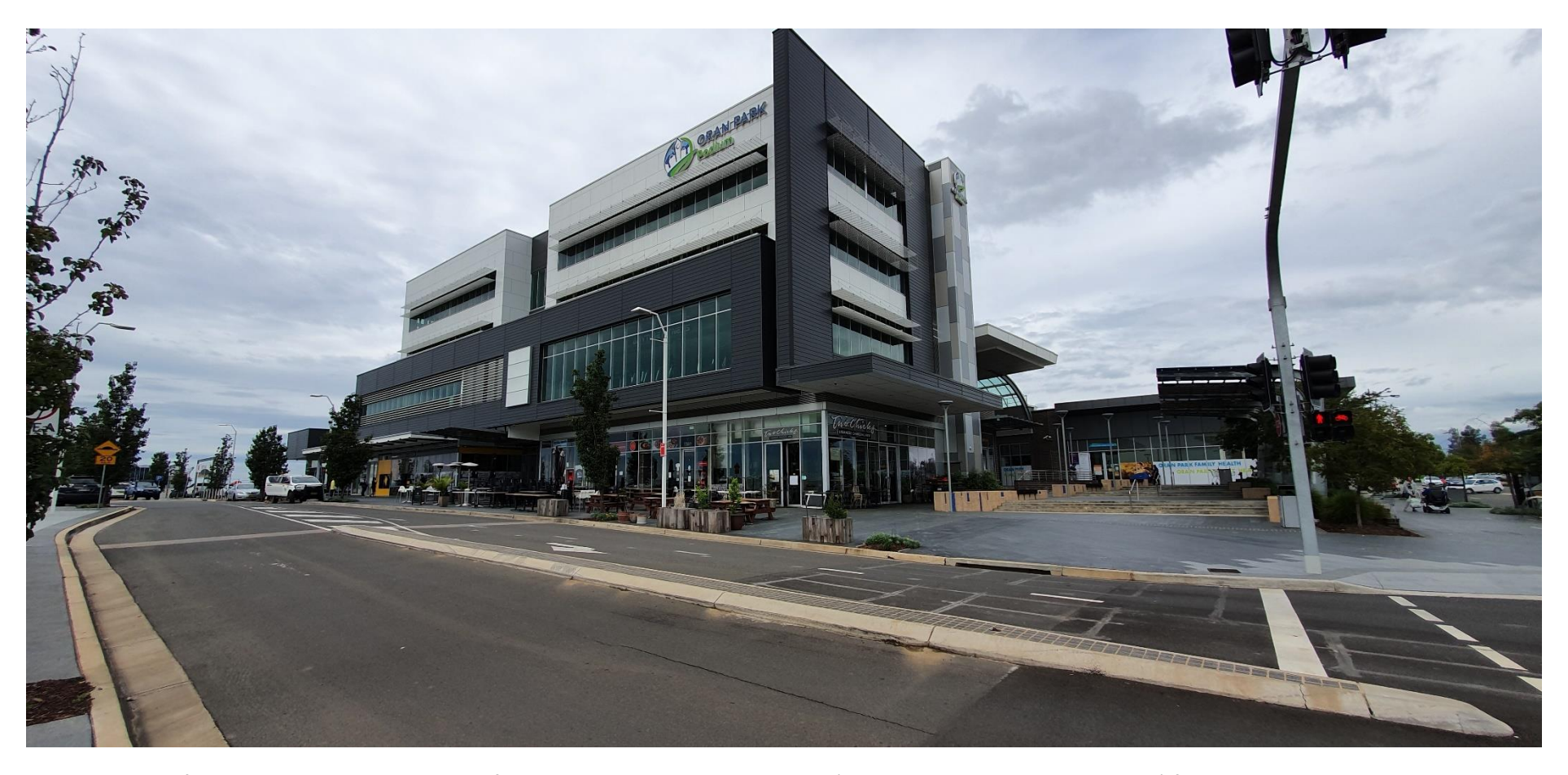
Figure 21: View from the north eastern corner of Oran Park Drive and Podium Way (known as Main Street in the DCP) facing south easterly. The existing Podium shopping centre is visible front the partially constructed Main Street.