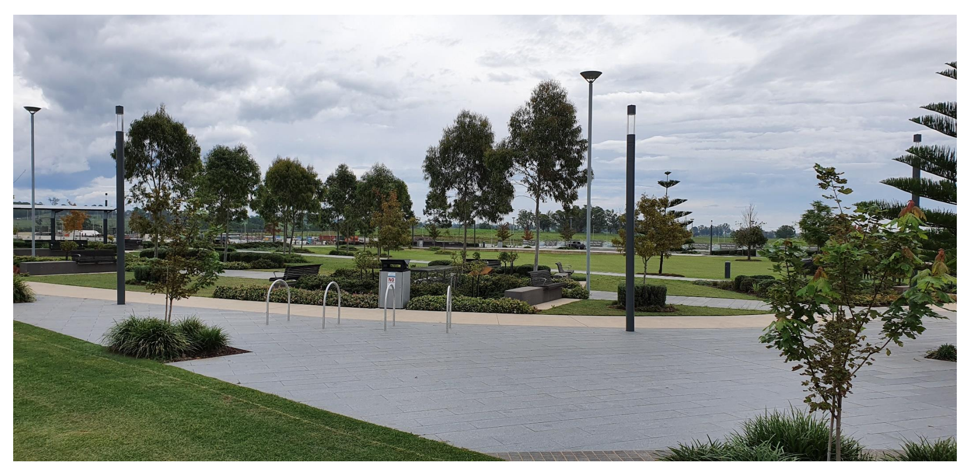
Figure 5: View from western corner of Dairy Street and Central Avenue, Oran Park. Taken from the subject site, where the proposed 'calmed street' is to be located. Facing north westerly, the Town Park (Perich Park) is visible.