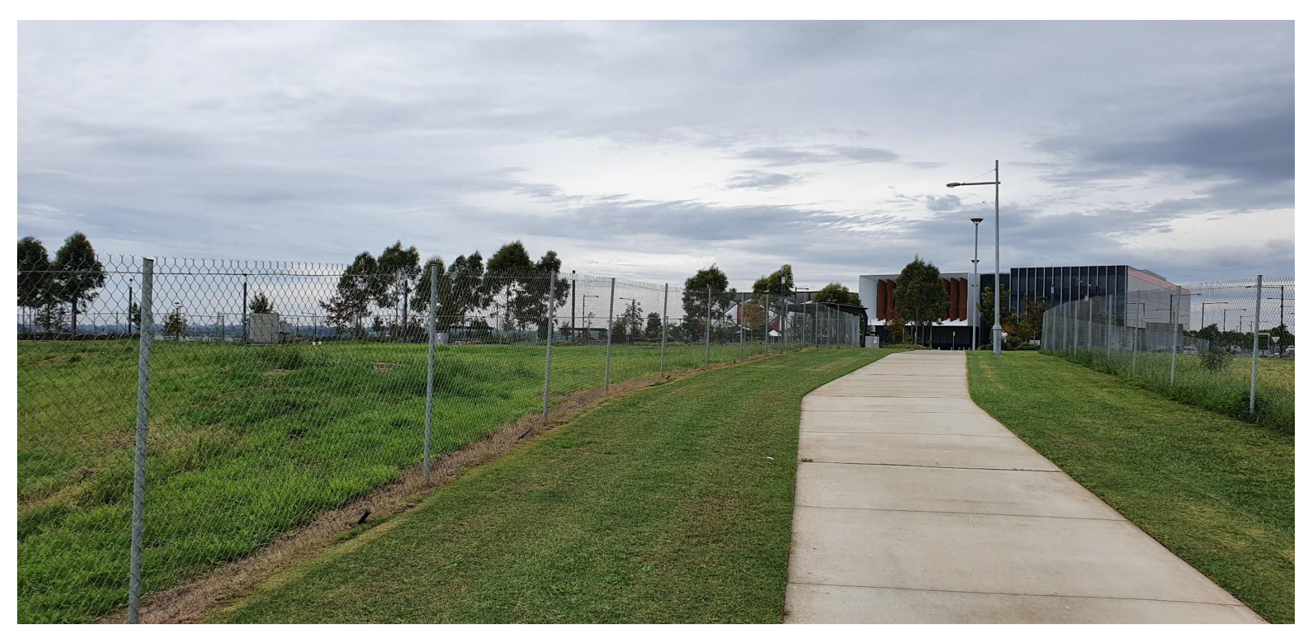
Figure 9: View from existing pedestrian pathway on the northern edge of the subject site, in the approximate location of the future pedestrian path. Facing east, the Camden Council building is visible.