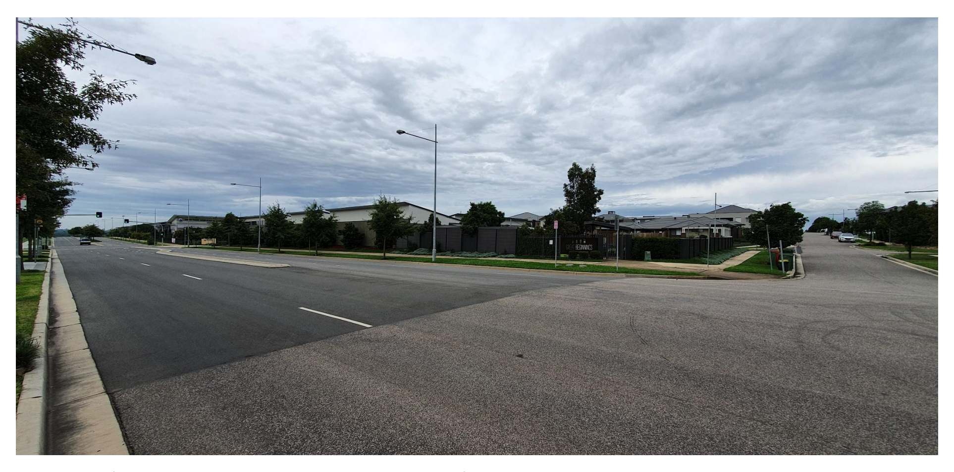
Figure 11: View from existing loading dock driveway at the southern edge of the subject site. Facing south easterly, a child care centre and lower density residential development is visible.