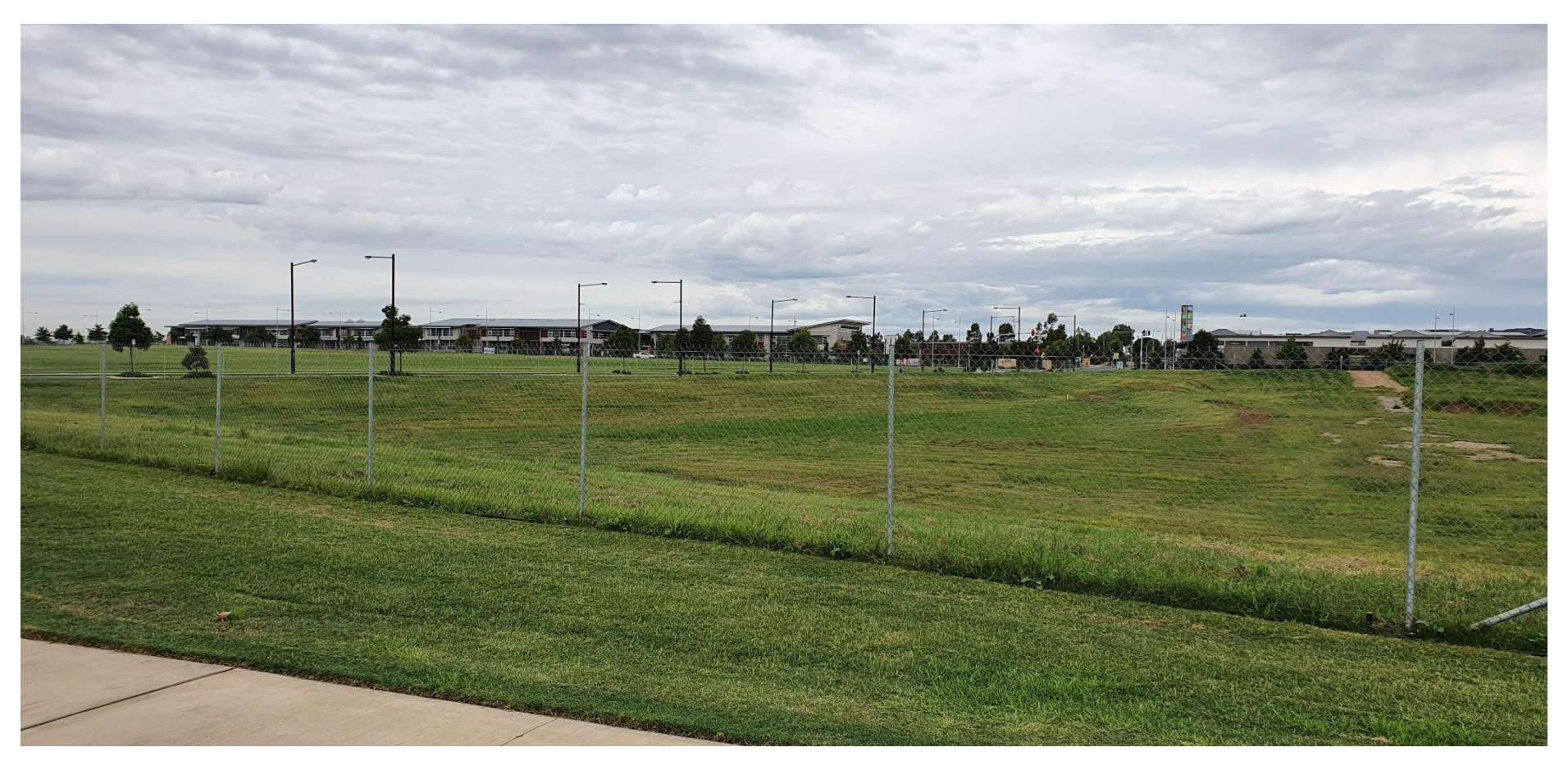
Figure 7: View from existing pedestrian pathway on the northern edge of the subject site, in the approximate location of the future pedestrian path. Facing south easterly, the vacant portion of the site is visible with the Oran Park Anglican school in the background.