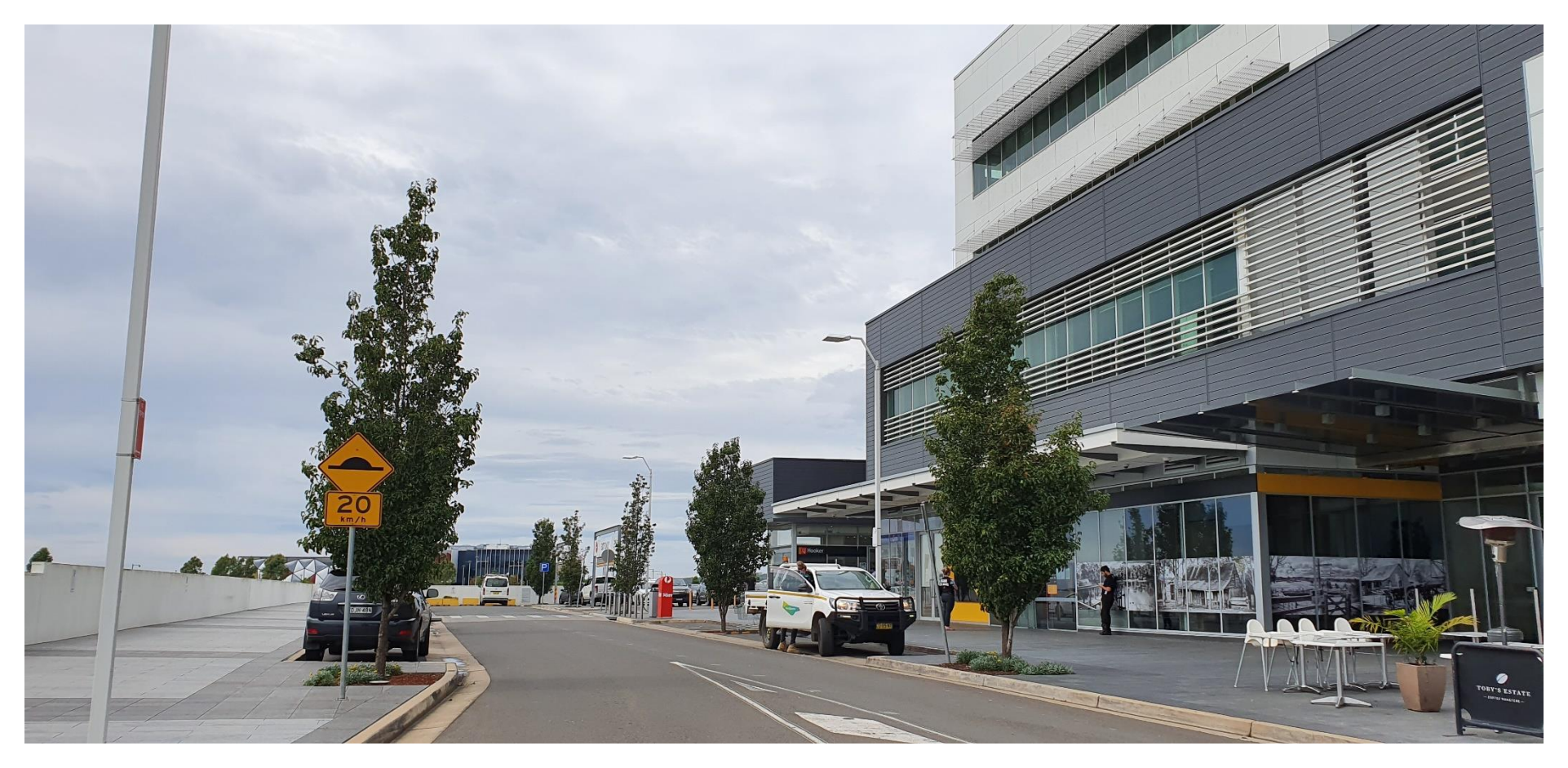
Figure 19: View from the north eastern corner of Oran Park Drive and Podium Way (known as Main Street in the DCP) facing east. The existing Podium shopping centre is visible on the right with the edge of the partially constructed Main Street in the centre.