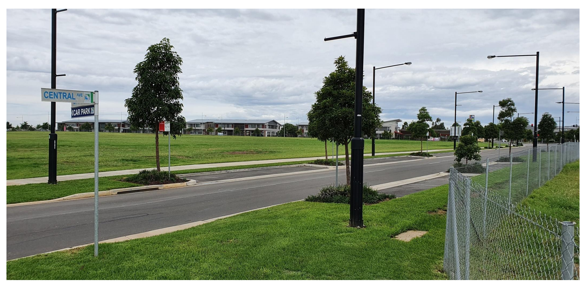
Figure 4: View from western corner of Dairy Street and Central Avenue, Oran Park. Taken from the subject site, facing directly south easterly a vacant site is visible with the Oran Park Anglican School visible in the background. The vacant site is envisaged to be mixed use by the Oran Park Indicative Layout Plan. The maximum height of building for the vacant site is 24m.